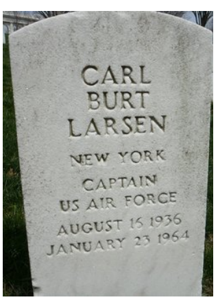
The tombstone at Arlington

He left behind a 6-year-old boy and a 4-year-old daughter.